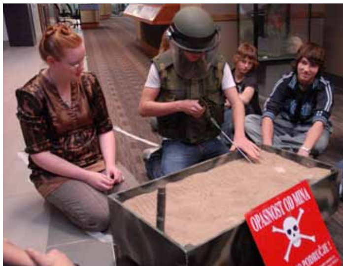
Students learn about the dangers of landmines in a simulated de-mining activity.

Learn the role of art in wartime. See how comics, propaganda, and paintings are used to sway public opinion and boost morale. Gain an understanding of the important job Canadian war artists have through a tour, a theatre presentation, and an art activity.