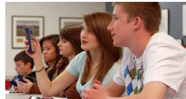
Students interact with learning content and vote using SMART Response™ interactive response system clickers in the Education Centre.

The role of women changed as a result of direct and indirect military action. Learn about the historical progression of women's rights in Canada.